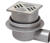
Illustration shows Art. no. 40 150.20