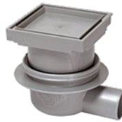
Illustration shows Art. no. 40 150.66

Recessed polymer drain cover for on-site tiling 110 × 110 mm, class K 3 or slotted cover 100 × 100 mm made of stainless steel AISI 304, class K 3