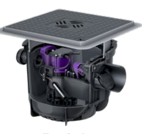
Illustration shows Art. no. 280 451S