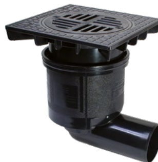
Illustration shows Art. no. 67 020.30