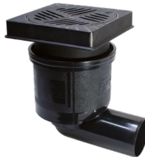
Illustration shows Art. no. 67 923B