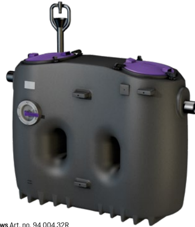
Illustration shows Art. no. 94 004.32R